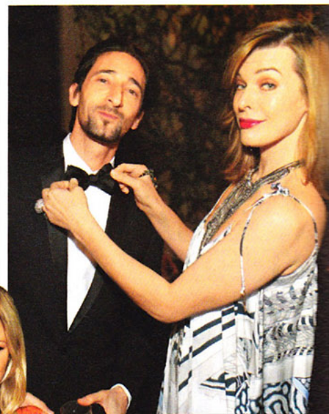
"I was into Greek mythology and fantasy, so I really loved The Hobbit and The Lord of the Rings ." — MILLA JOVOVICH in Pucci with ADRIEN BRODY