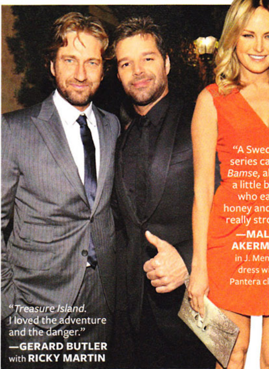
" Treasure Island . I loved the adventure and the danger." — GERARD BUTLER with RICKY MARTIN

We asked ... What was your favorite kids book? At the Bulgari Benefit for Save the Children U.S. and Artists for Peace & Justice